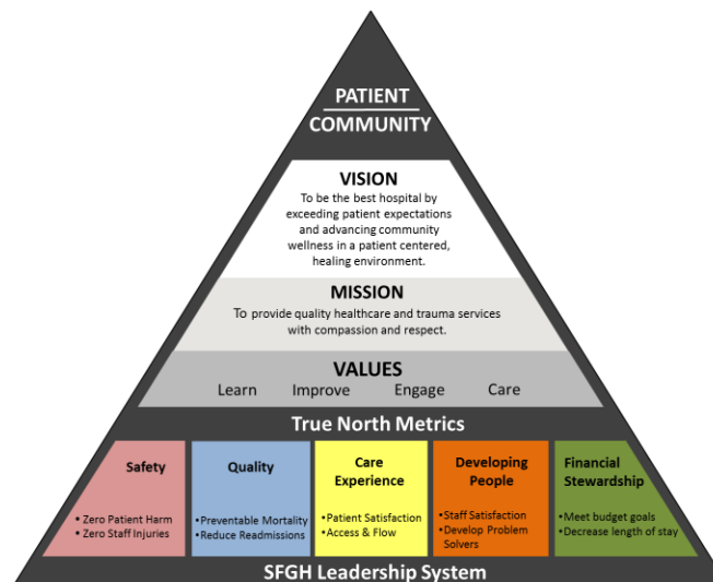
Figure 1: True North

True North will keep us certain that any activity we are engaged in supports our delivery of the best patient care possible, and keeps us moving in the right direction as an organization.